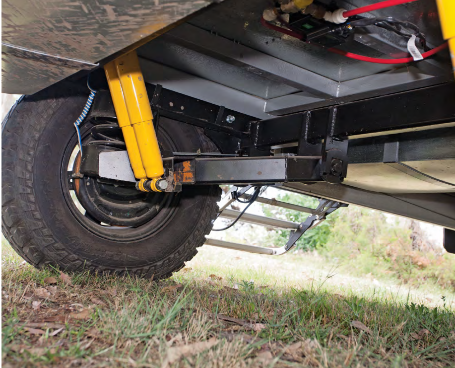
CLOCKWISE FROM LEFT Dual shock absorbers fitted to Oz Trekker suspension; The Swift slide-out kitchen is most welcome; Battery box welded to chassis rail