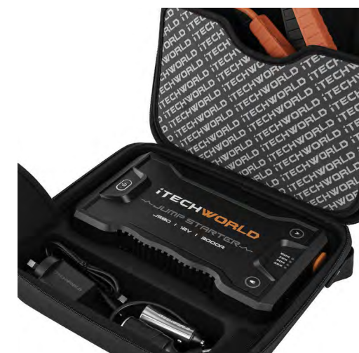
JS80 JUMP STARTER With Heavy Duty Case