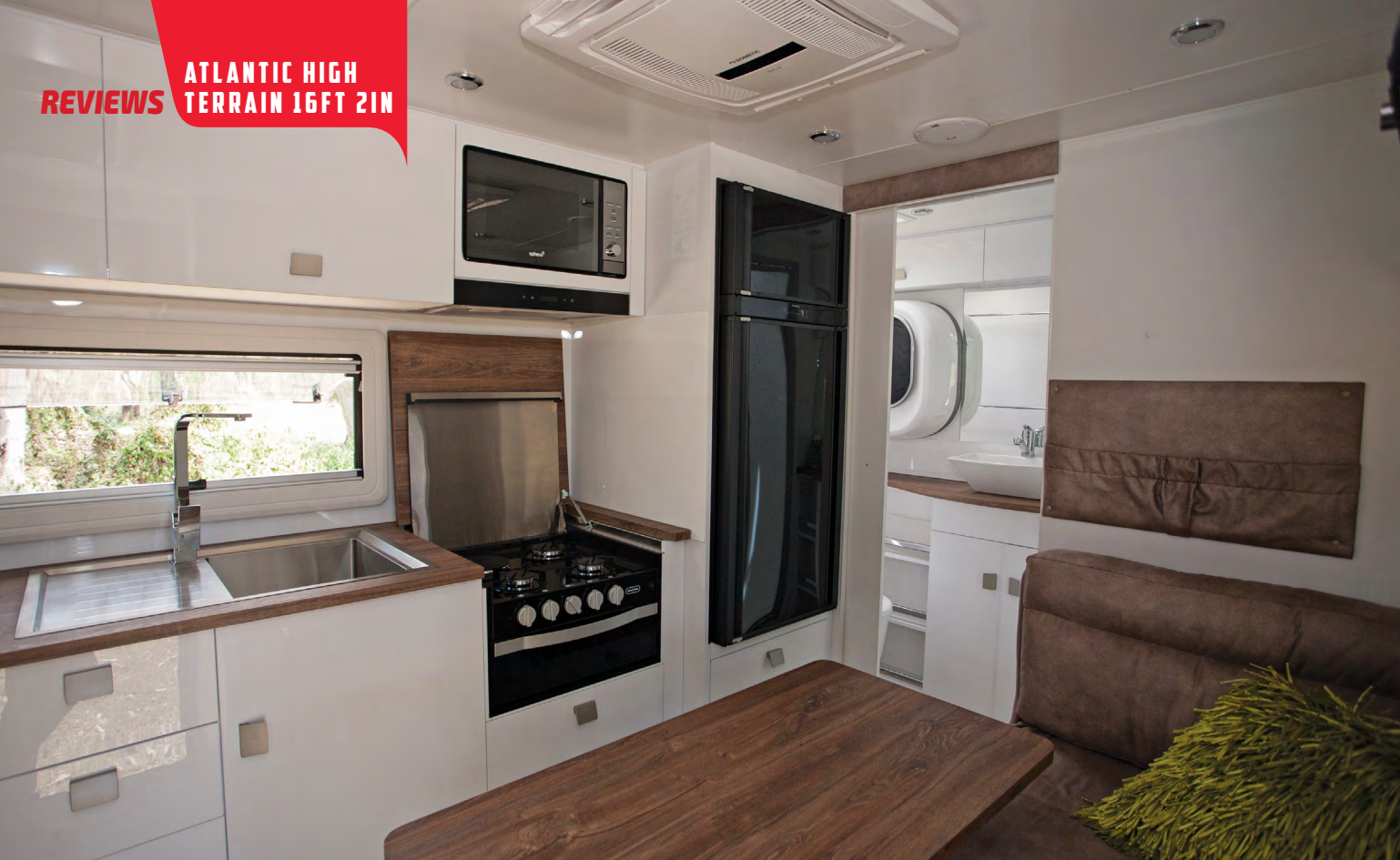
ABOVE Despite the van's small size, the kitchen benchspace and storage doesn't disappoint